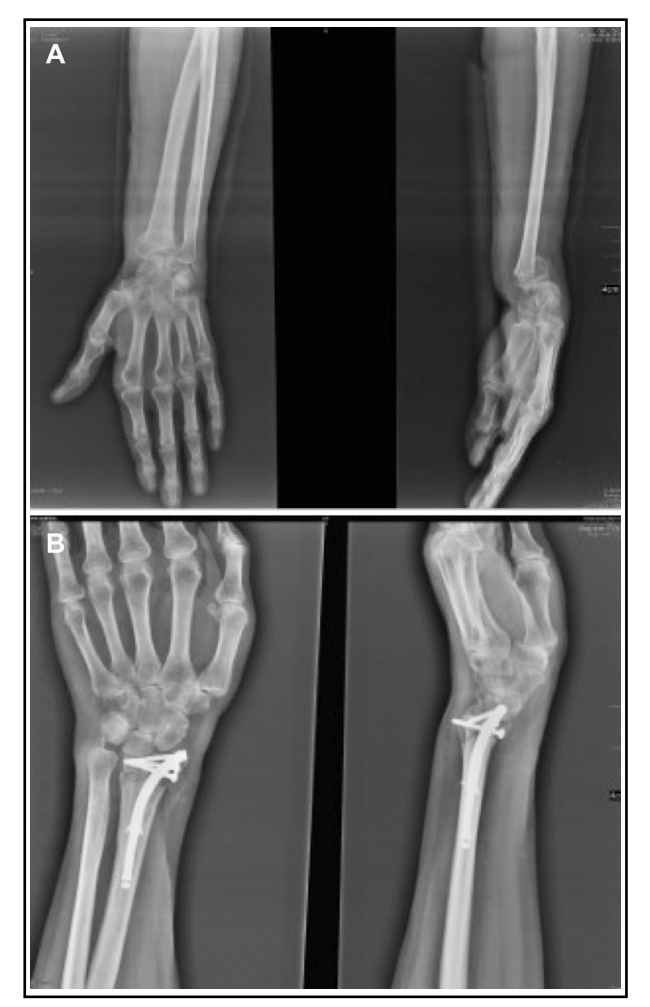
Fig.1: Anteroposterior and lateral radiographics of distal radius fractures before (a) and after (b) internal fixation with intramedullary nailing device Sonoma Wrx.

appropriate, and evaluated by Shapiro-Wilk's test for normality of distribution. Chi-square or Fisher's exact test was used for the comparison of categorical data, while the Student's t test or Mann-Whitney U test was used to compare continuous data for normally or non-normally distributed data, respectively. To compare preoperative and postoperative continuous variables, the paired t test or Wilcoxon signed rank test was used. Statistical analysis was made using IBM SPSS Statistics for Windows, Version 22.0 (IBM Corp., Armonk, NY, USA). p<0.05 was considered statistically significant.