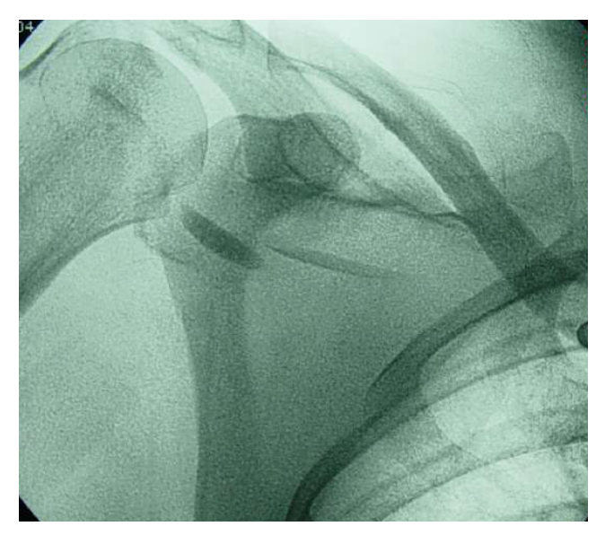
Figure 1. AP roentgenogram shows minimally displaced fracture of greater tuberosity.