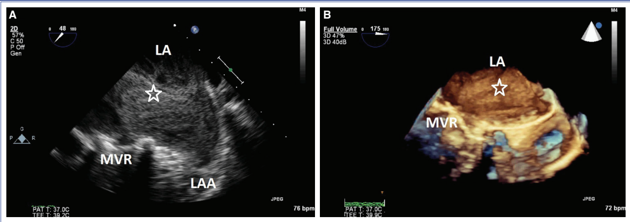
Figure 1. (A) Two-dimensional and (B) real-time 3-dimensional transesophageal echocardiography views revealing spontaneous echo contrast (stars) as dynamic, smoke-like echoes within the left atrium with a characteristic swirling motion. LA: Left atrium; LAA: Left atrial appendage; MVR: Prosthetic mitral valve.

Statistical analyses were performed using IBM SPSS Statistics for Windows, Version 19.0. (IBM Corp., Armonk, NY, USA). Descriptive statistics were reported as mean±standard deviation for continuous variables with normal distribution or median (25<sup>th</sup>-75<sup>th</sup> percentiles) values for continuous variables without normal distribution and as frequency with percentages for categorical variables. The Shapiro-Wilk test was used to test the normality of the distribution of continuous variables. The Student's t-test or the Mann-Whitney U test was used to compare continuous variables, as appropriate. Categorical variables were compared using a chi-square test. Multivariate regression analysis