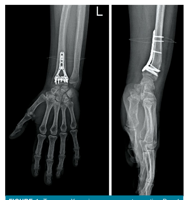
FIGURE 1. Two-way X-ray images on postoperative Day 1 of a 53-year-old female applied with volar plate for left-side distal radius fracture.

Statistical analysis was performed using the IBM SPSS version 22.0 software (IBM Corp., Armonk, NY, USA). Descriptive data were expressed in mean \pm standard deviation (SD) or median (min-max) for continuous variables and in number and frequency for categorical variables. Conformity of the data