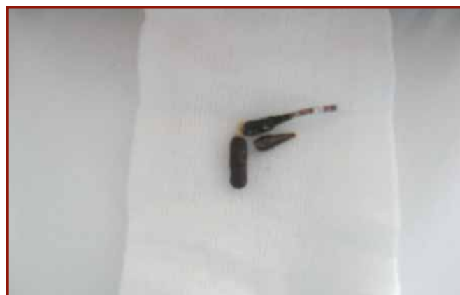
Figure 3. Removed IUD (divided)