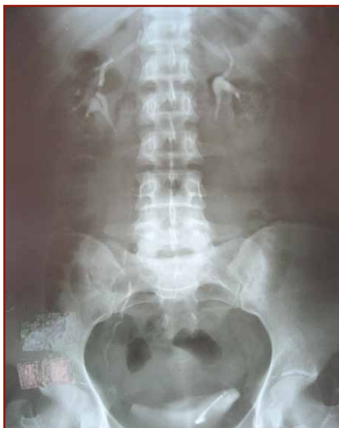
Figure 1. IUD overlapping on to the urinary bladder in IVP

The vaginal examination revealed that the IUD was dislocated. Pelvic ultrasonography revealed hyperechogenicity in the bladder wall, which might be consistent with IUD. Intrauterine device was detected in the pelvis via direct pelvic radiography examinations. No pathological findings were established in the abdomen ultrasonography. Intravenous pyelography showed us that the IUD was overlapped over the urinary bladder (Figure 1). Cystoscopic examination under local anesthesia, revealed that the IUD was penetrating the posterior wall of the bladder and was fixed to the bladder wall (Figure 2), not lying free in the bladder with calculus formation surrounding it's body partially. A second cystoscopy was performed under general anesthesia, but the tail of IUD cannot grasped by standard forceps. Then the application was repeated by using nephroscopy shaft and nephrostomy forceps and the IUD was easily removed as a whole unit by pulling it through the perforation site and by the aim of gently taken out through the cystoscope we divided the IUD into two pieces intravesically(Figure 3). A Foley catheter was left in bladder for 5 days. The patient was discharged 3 days after the IUD removal without complication.